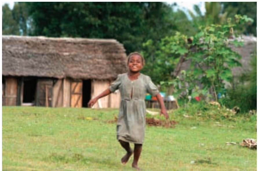
HAUNTING MEMORIES Amid natural beauty I had been blessed by few possessions, few distractions.

Today, as I scroll through hundreds of e-mails or switch to call-waiting on my cell